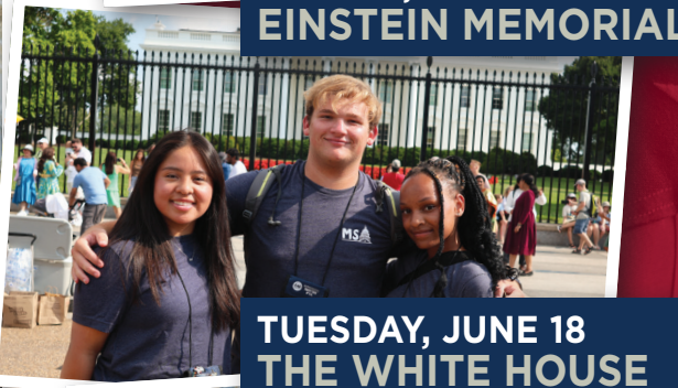
TUESDAY, JUNE 18 THE WHITE HOUSE