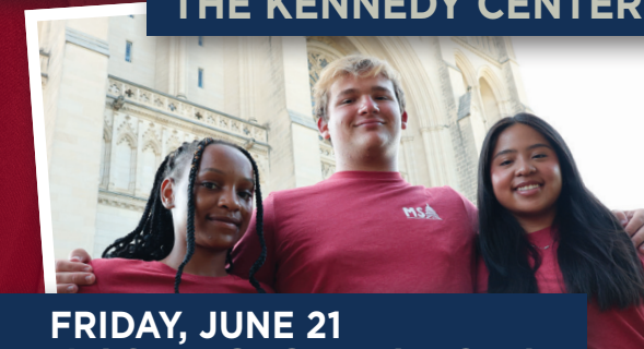
FRIDAY, JUNE 21 WASHINGTON NATIONAL CATHEDRAL