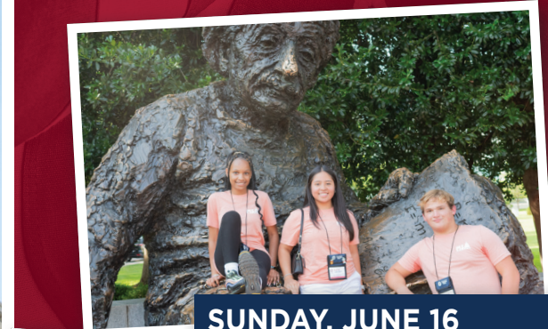
SUNDAY, JUNE 16 EINSTEIN MEMORIAL