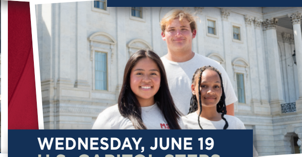
WEDNESDAY, JUNE 19 U.S. CAPITOL STEPS