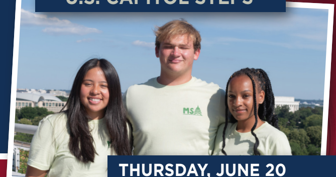
THURSDAY, JUNE 20 THE KENNEDY CENTER